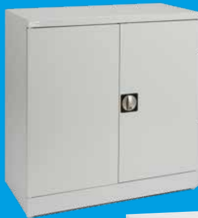
swing door cupboards Assembled Half Height Cupboard c/w 1 Shelf QFSMCA