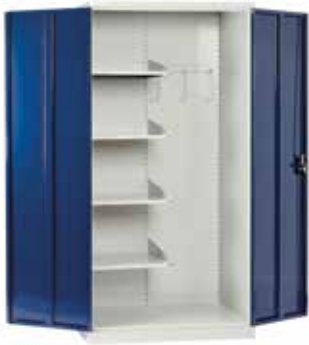
janitor cupboard Premium utility cupboard with 4 half-width adjustable shelves and hooks UTC3