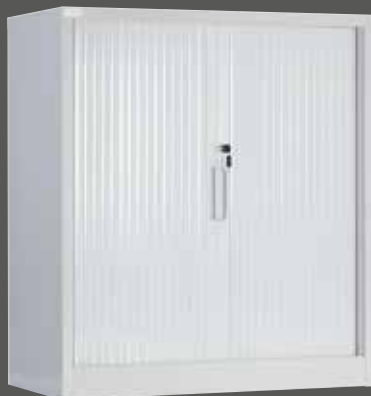
side opening tambour TDM A