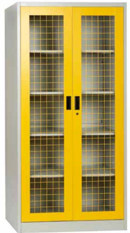
mesh door cupboard QFSMDC