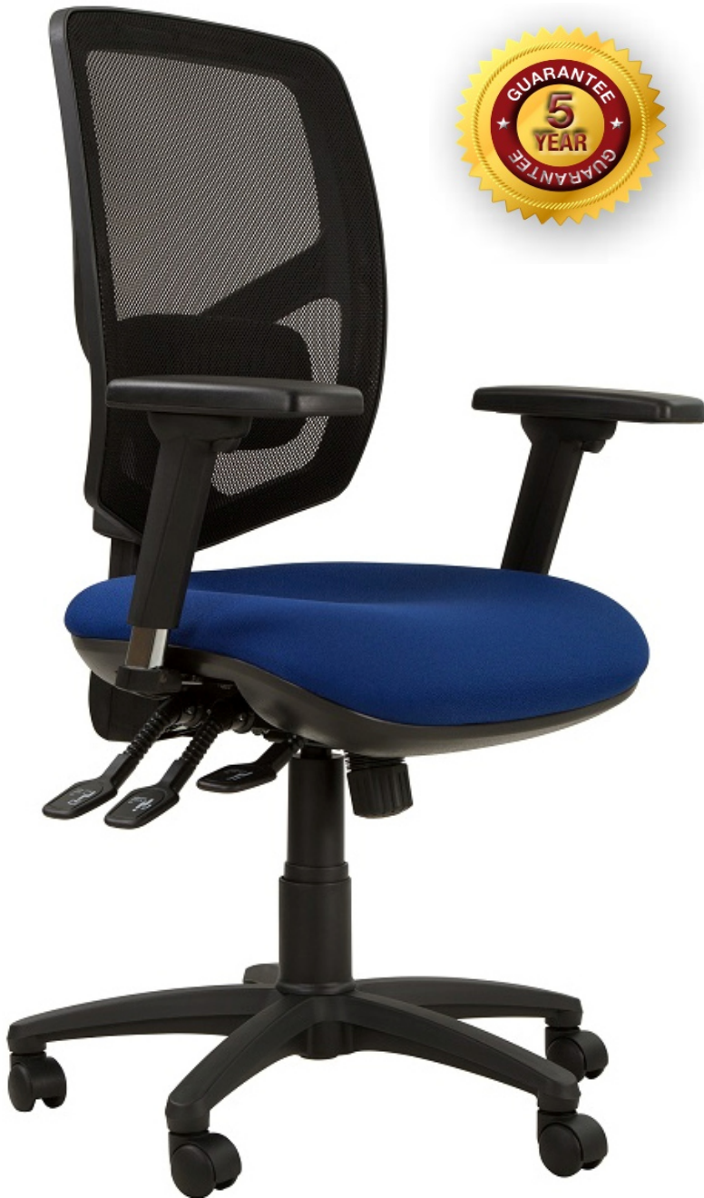
Model Shown: HT044 with black 5-star base